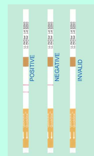
Any clearly discernable pink Test Line is considered positive