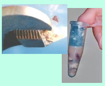
Crush single seed, add Buffer