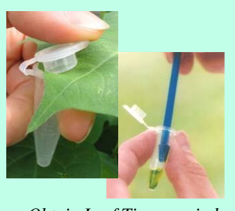
Obtain Leaf Tissue, grind