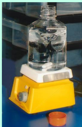
Prepare wash buffer and grain extraction solutions