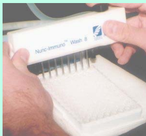
Strip Plate Wash option