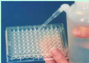
Bottle Wash method