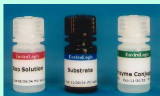
Allow all reagents to reach room temperature before beginning