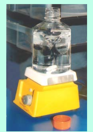
Prepare wash buffer and extraction solutions