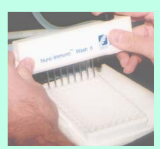
Strip Plate Wash option