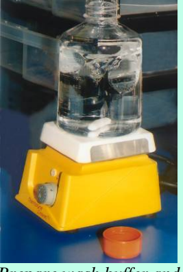
Prepare wash buffer and extraction solutions