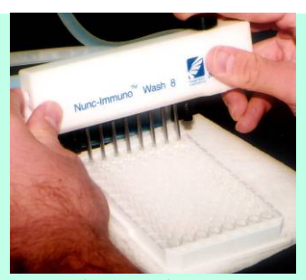
Plate Wash option