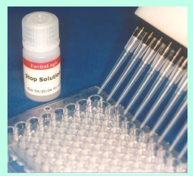
Complete protocol and add Stop Solution