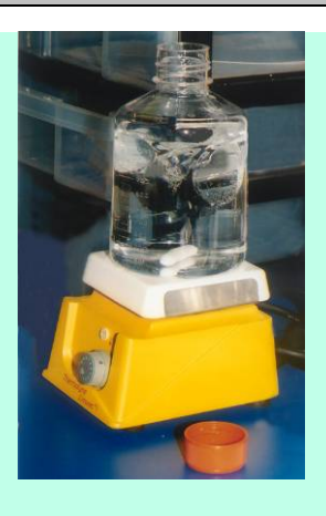
Prepare Wash /Extraction buffer