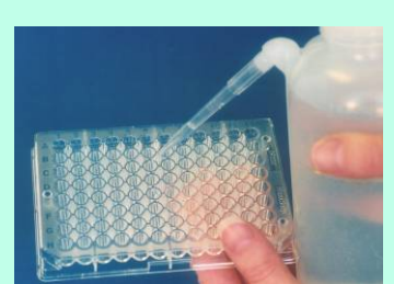
Bottle Wash method