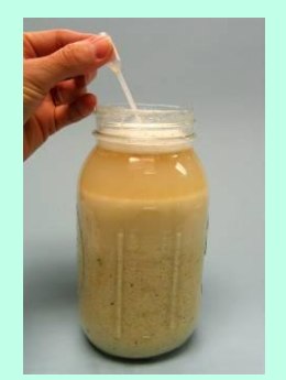
Avoid pulling up particles when drawing sample