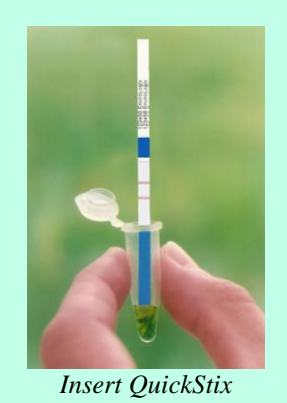
Any pink Test Line is considered positive

Alternatively, remove the dropper tip from the bottle and dispense 1.0 mL (1000 microliters) into each tube using a pipette.