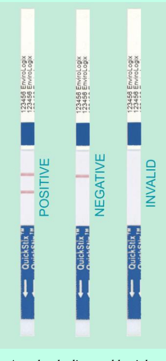
Any clearly discernable pink Test Line is considered positive