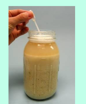
Avoid pulling up particles when drawing sample