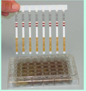
Insert Combs into plate

Any clearly discernable pink Test Line is considered positive