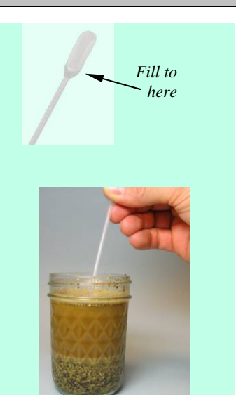
Avoid pulling up particles when drawing sample