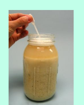
Avoid pulling up particles when drawing sample