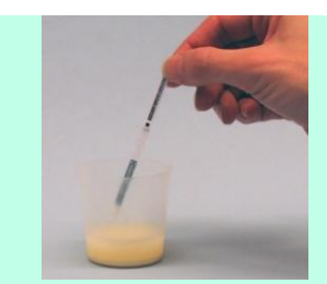
After 30 seconds, add QuickStix to cup