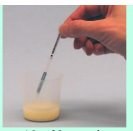
After 30 seconds, add QuickStix to cup